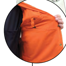
Large Inner Pockets with VELCRO® Closures