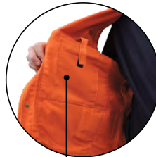
Two Inner Cell Phone/ Accessory Pockets with VELCRO® Loop Closures

Fabric is OEKO-TEX® CONFIDENCE IN TEXTILES STANDARD 100