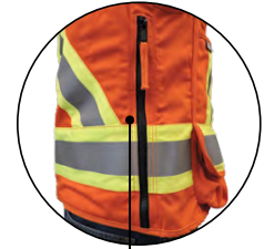
Reinforced Map Pocket with Zipper Closure